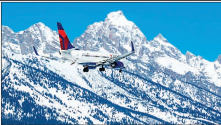
JACKSON HOLE, WY – Wheels down for another flight landing at Jackson Hole Airport (JAC) with the beauty of the Grand Teton Mountains as a backdrop. Find easy access with non-stop flights from 12 major U.S. cities. It is easy to book your flight, just call 1-866-265-4037. JHMR has 4,139 vertical feet of great terrain on 2,500+ acres, half of which are beginner trails and intermediate terrain.

Jackson Hole Airport (JAC) is the only commercial airport in the United States located within a national park, Grand Teton. Upon arrival at the airport, you are an easy 30-minute drive to the mountain resort by car, taxi or rental car. There are no mountain passes, tunnels or four lanes of bumper-to-bumper traffic. Once in Jackson, their public bus system, named START, allows