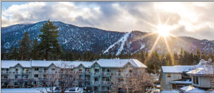
SOUTH LAKE TAHOE, CA - The Beach Retreat has it all, with two restaurants for you to relax after a great day on the nearby slopes. It is close to Heavenly and about 40 minutes to Sierra-at-Tahoe. The nightlife is nearby as well to make for a fun week or weekend.

The Beach Retreat & Lodge’s sophisticated 3,200-square-foot Conference Center is the perfect event and meeting space featuring state-of-the-art technology, indoor and outdoor space, a dedicated catering staff and a meetings team that is as good with logistics as they are creativity. The Conference