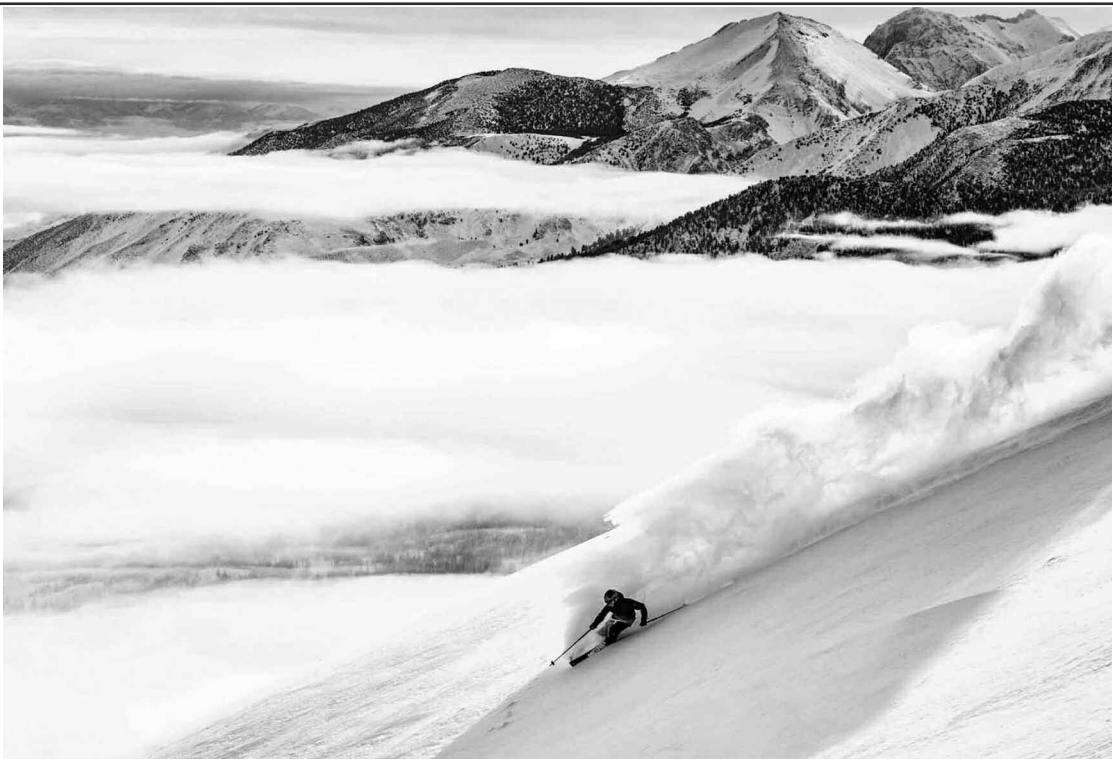
MAMMOTH LAKES, CA - Gently sliding down one of Mammoth Mountain’s powder filled trails this skier is focused and may be missing the spectacular above the clouds view. Mammoth received more than 700 inches of snow in the 2023-24 winter season which lasted until August 6th. Powder days as well as cruising days were plentiful.

Did we mention that the mountain got over 300 inches more snow than average in 2022-23? Add in Mammoth Lakes’ average of 275 days of sunshine per year and that equals an unreal alpine destination. Where else can you barrel down a powder-soft mountain while the California sun beams through an azure sky and crystalline lakes glim-