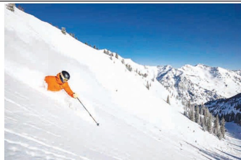
SALT LAKE CITY, UT - Another powder cruise on a sunny day at Snowbird. Snowbird broke its previous snowfall record of 783 inches set in 2010-11 and ended above 838 inches. The resort also has had 47 days with 6-inches of new snow or more.

According to the National Ski Areas Association, the ski industry is a major contributor to the United States economy with over $55 billion in retail spent and more than 533,000 jobs across all 50 states. In Utah, ski and snowboard visitors